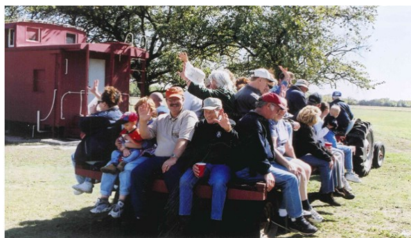
Hayrack ride at Wilson's Farm, 2001

Parish Visitor, September 1986: IS IT TRUE that pulling weeds can be fun? Find out at St. John's Garden Party on the evening of Thursday, September 4th. Come to the corner of Third & Topeka Streets at (or about) 7:00 p.m. in old clothes and your favorite weed-pulling gloves or tool. You will find fellow parishioners seeking truth through toil. Yes, work shared can be fun. Come and see for yourself.