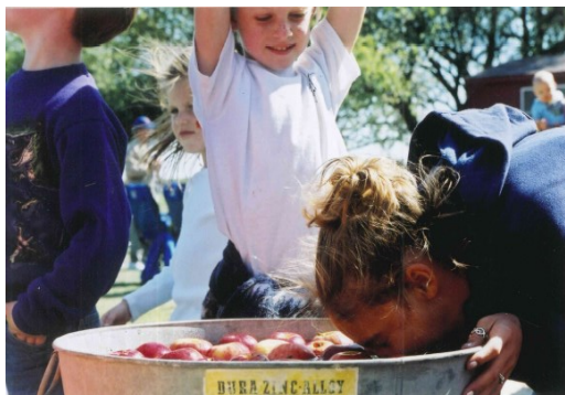
Bobbing for apples at Wilson's Farm, 2001

EVERYBODY'S INVITED!!! September 7, 4 p.m. until ??? is on St. John's parish calendar for a special kind of picnic at Watson Park. The Newcomers Committee and the Christian Education Committee have teamed up to offer an afternoon of recreation and fellowship for all. This event will kick off this fall's Church School programs, and will honor newcomers to our parish family, Church School staff & Vacation Bible School teachers, and grandparents, too. (Sept. 7 is Grandparents' Day!) ~ Bring the beverage of your choice and all your favorite sandwich fillings. St. John's will provide the rest of the meal, and our contributions will be combined to build the largest submarine sandwich in parish history!