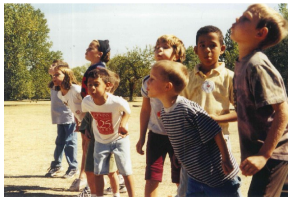
Spitting watermelon seeds, Sedgwick Co. Park, 2000

Hyde Park and Sedgwick County Park have also been the sites of fall fun. Pictures will be posted soon on the History Bulletin Board.